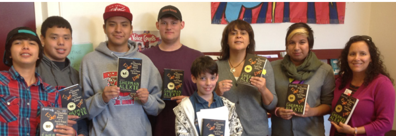
Britannia Secondary Aboriginal Book Club