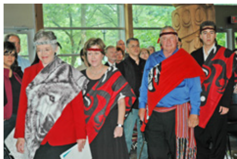
Photos above: signing of the Vancouver School District's first AEEA (June 25, 2009)