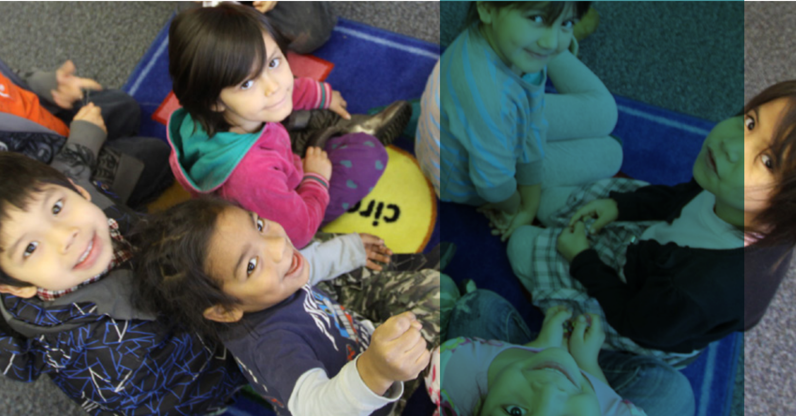
Cover photo and photo below are students in the Aboriginal Focus Program at Macdonald Elementary