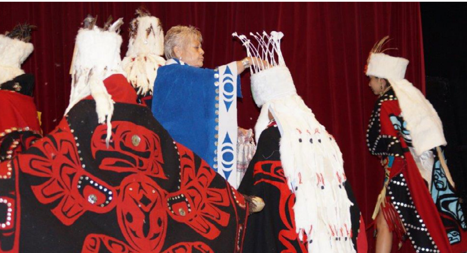
Aboriginal Grade 12 Graduation Ceremony