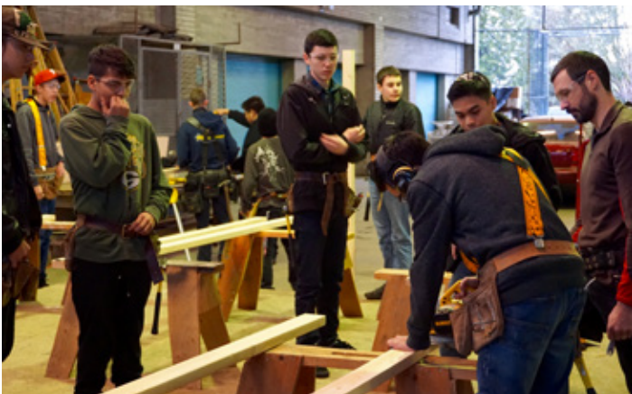
First Nations Trades Sampler - Over 40 youth of Aboriginal heritage from Vancouver and across the Lower Mainland spend the day at John Oliver Secondary working with industry professionals.