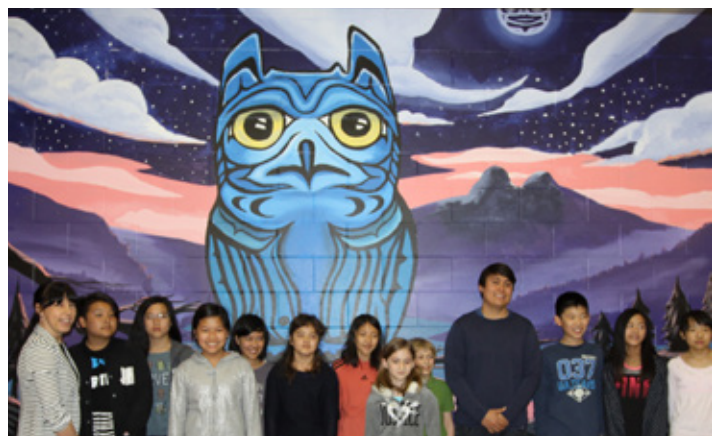
Students and staff at Sir William Osler Elementary School, along with a special guest artist, are all involved in the creation of an expansive piece of First Nations artwork