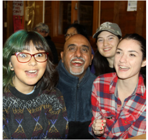
Grade 12 Aboriginal grad retreat: An opportunity to celebrate the students' successful entry into Grade 12 as well as learn about university and college application procedures, band funding, scholarships and lots of other valuable information necessary for the Grade 12 year