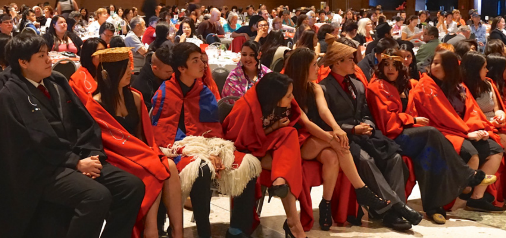
2015 Aboriginal Graduation Celebration

(2005) and others who have done extensive research on Reading Recovery. At present there are 52 of the 92 elementary schools in Vancouver that have Reading Recovery programs.