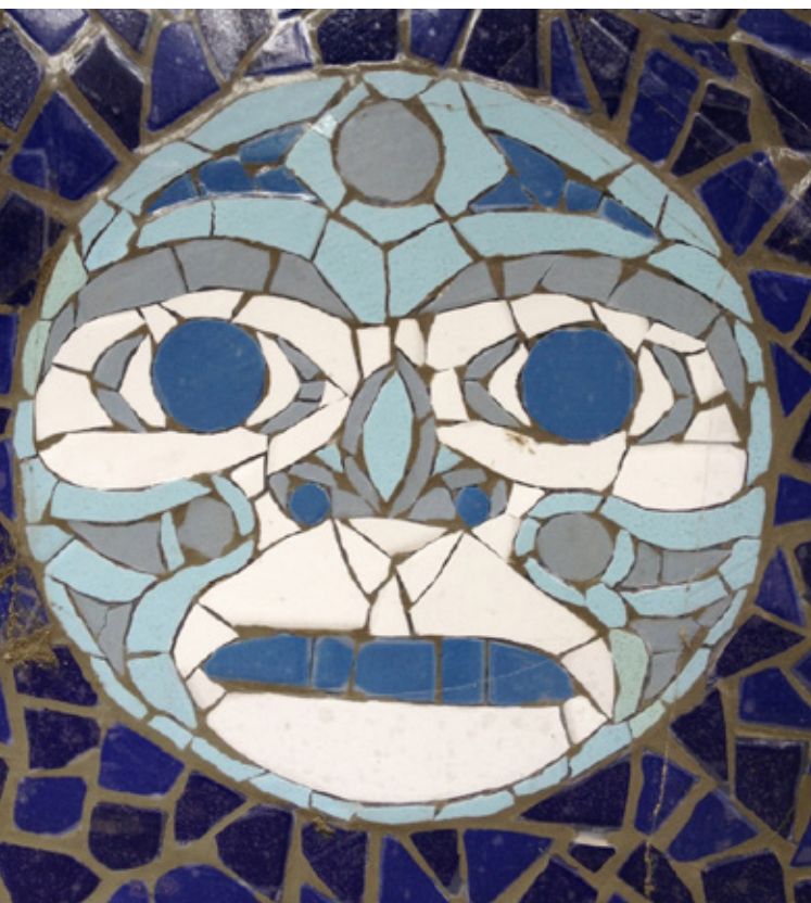
Grandview/Łuuqinak'uuh Elementary School tile mural.

issue at all levels of the K-12 system. The District is implementing an attendance strategy to track and improve attendance for all students. Recognizing that there may be different reasons for attendance issues amongst our Aboriginal students, our Aboriginal staff will be working with school support staff to ensure that these issues are recognized and supported in a sensitive and appropriate manner.