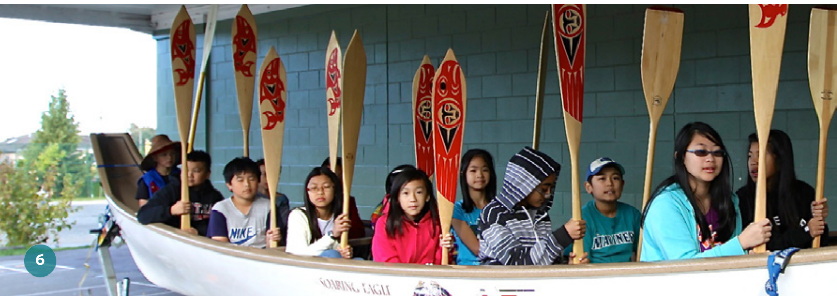
Nootka Elementary Celebrates Gathering Day