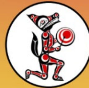
səlilwətał (Tseil-Waututh Nation)