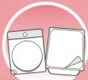
Flexible Packaging with Plastic Seal

During the collection event, bring your flexible plastics from home to school for recycling.