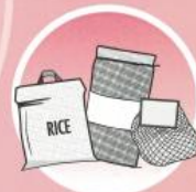
Woven Plastic Bags

The more you collect the more $ for your school. $2 for every kilogram collected.