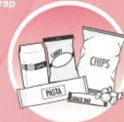
Crinkly Wrappers and Bags