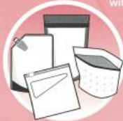
Zipper-lock and Stand-up Pouches