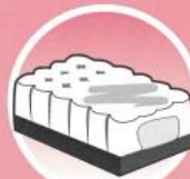
Outer Bags and Overwrap