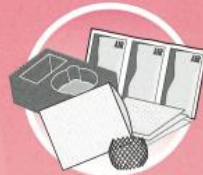
Protective and Squishy Cushion Packaging