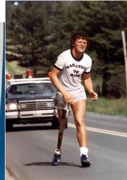
PHOTO DAY- MONDAY 7 th OCTOBER