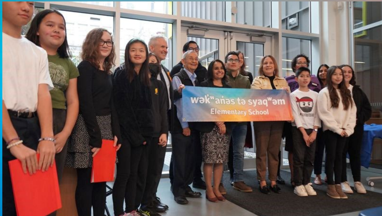
wə́kʷaṅəs tə syaqʷəṃ school renaming ceremony on December 9, 2022.

Ed Plan goal: The Vancouver School Board will continue its Reconciliation journey with First Nations, Métis, and Inuit by ... Increasing knowledge, awareness, appreciation of, and respect for Indigenous histories, traditions, cultures, and contributions.