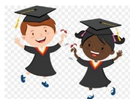
Grad Activity Calendar