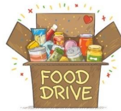
Canley Cup Food Drive