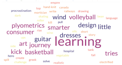
KG Annual MYP Fair