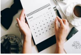
Dates to Remember