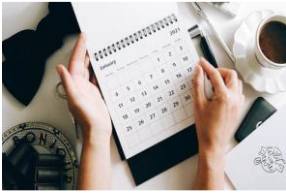
Dates to Remember