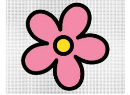
Spring Fling Dance