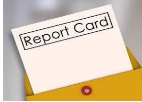
Semester 2 Interim Report