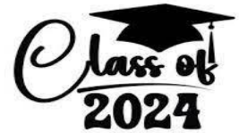
Grad Ceremony/ Dinner & Dinner & Dance Info