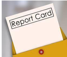
Report Cards & Semester Change