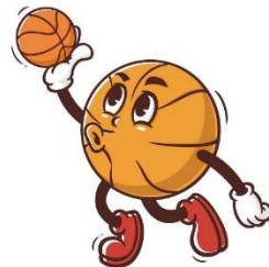
Senior Boys Basketball