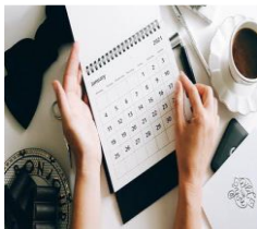
Dates to Remember