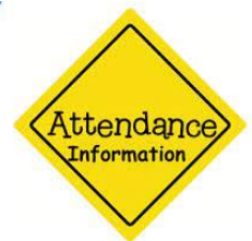
Attendance Call Out Update