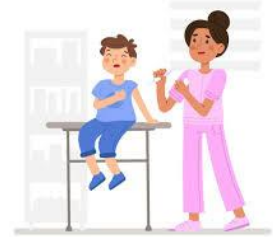
Grade 9 Immunization