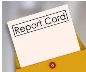
Semester 1 Mid-Terms