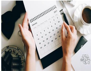
Dates To Remember