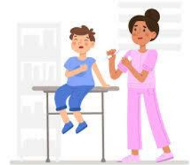
Grade 9 Immunization