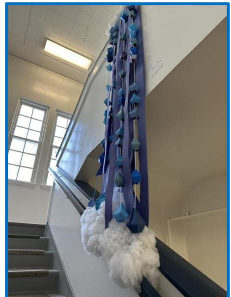
Ceramics and Sculpture 11/12 Paper Sculptures