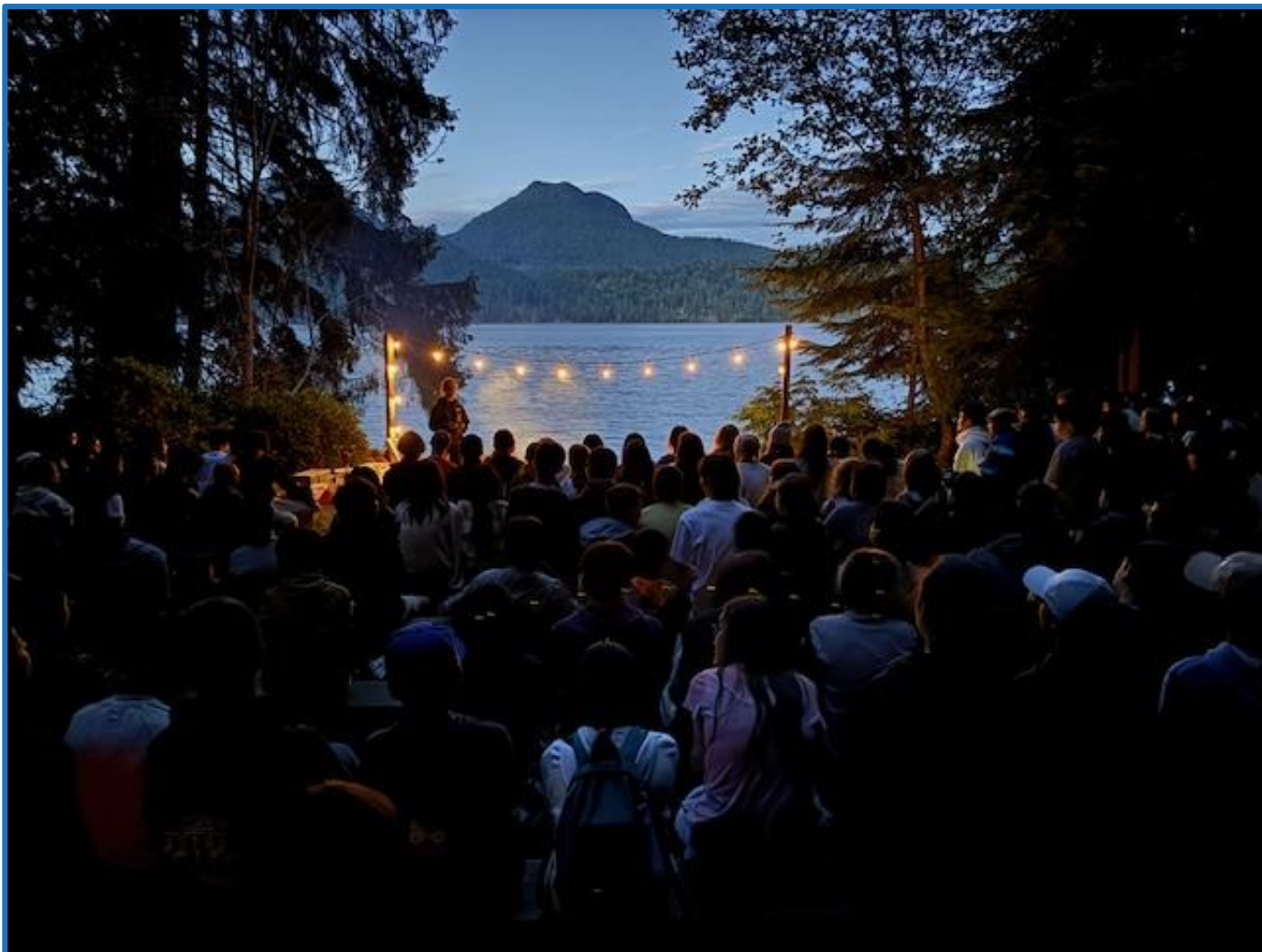
Grade 8 Camp, Camp Elphinstone, Sunshine Coast