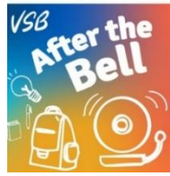
After the Bell Podcast