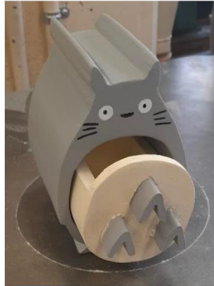
BOXES WITH DRAWERS

During the semester, we will learn how to use woodworking tools to make these projects: