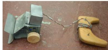
MAKE YOUR OWN SUMO-ROBOT