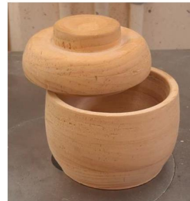
BOWLS & JARS