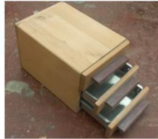
METAL CHEST OF DRAWERS

We change projects every year, but here are some projects we may do: