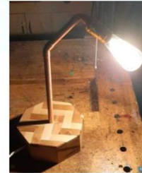
COPPER PIPE LAMP