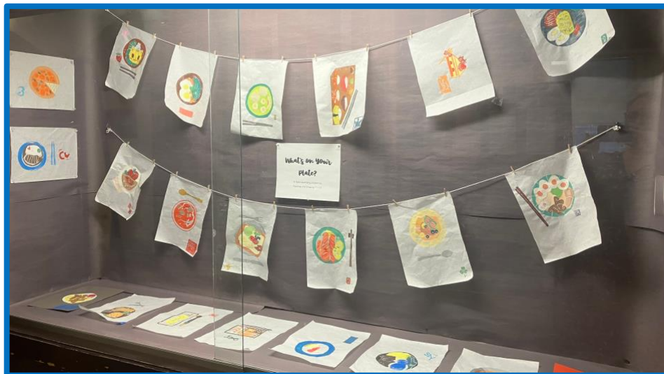
What's on your Plate? A Foam sampling project – Drawing & Painting 11/12

We wish all our students a fabulous end of Semester 1 and beginning of Semester 2!