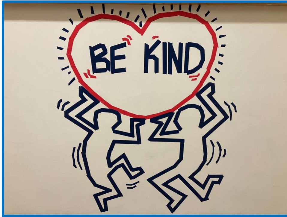
Temporary Public Art Murals using Painter's Tape – Art 8