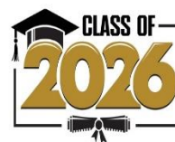
Class of 2026