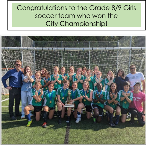
Congratulations to the Grade 8/9 Girls soccer team who won the City Championship!