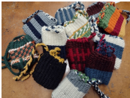
BC First Peoples 12 classes explored Coast Salish-style weaving's traditional history and resurgence by making Quarter Bags.