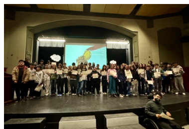
Celebration of Champions, Gr. 8-10