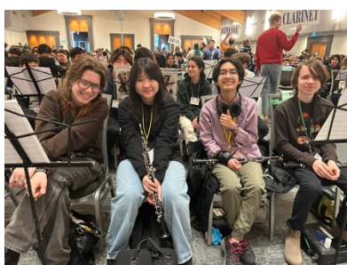
Senior band tour, Nelson

The month of May will be a busy one for Music students. Van Tech will host Choir Fest, the District Choir Festival, on May 16 th . May 29 th is the Concert Band and Jazz Awards Concert, and the Orchestra and Choir Spring Awards Concert is on June 5.