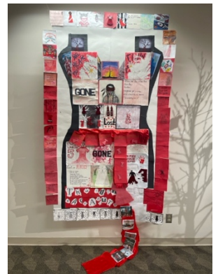
Student work on display at the VSB offices.

We encourage students who enrolled in summer school to communicate their plans to their counsellors. This ensures that their course selections for the upcoming academic year reflect these plans. As always, parents and caregivers who have questions or concerns about their child's school experiences are encouraged to contact their child's grade counsellor or any administrator. And as we race towards the academic year's end, let's carry forward the momentum of our past successes and channel our energies toward academic excellence and personal growth.