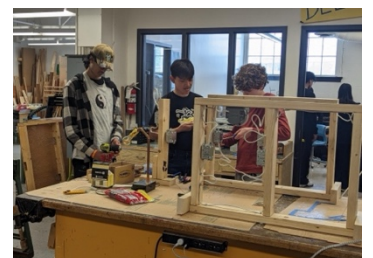
Robotics, Electronics and Exploring Trades students.