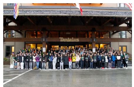
Junior band tour, Whistler