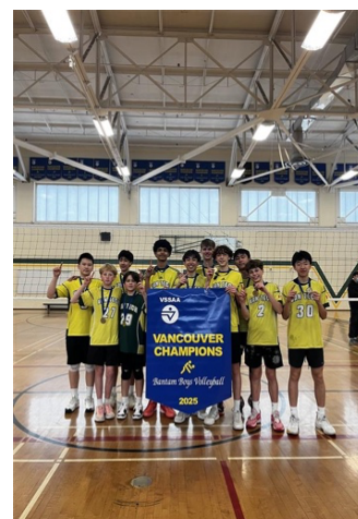
Bantam Boys Volleyball