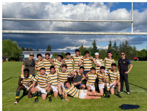
Senior Boys Rugby 7s