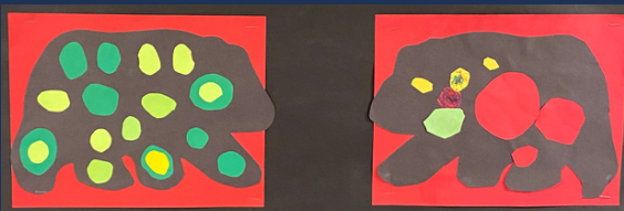
Bears are for Courage by Division 12