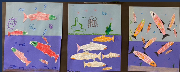
Indigenous Cultural Value of Bella Bella: Gratitude by Division 6