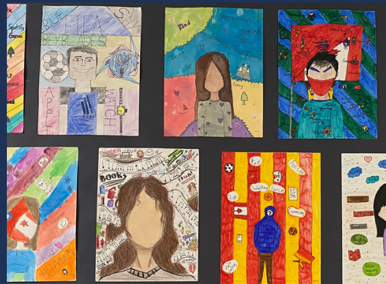
Express Yourself by Division 2 and 3