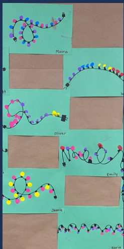
Holiday lights by Division 18