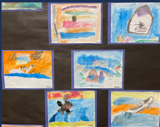
Orca Chief by Division 13