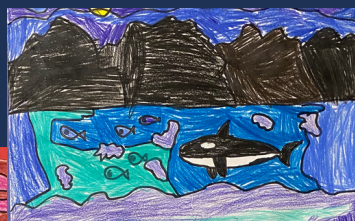
Art Work inspired by Ted Harrison by Division 10