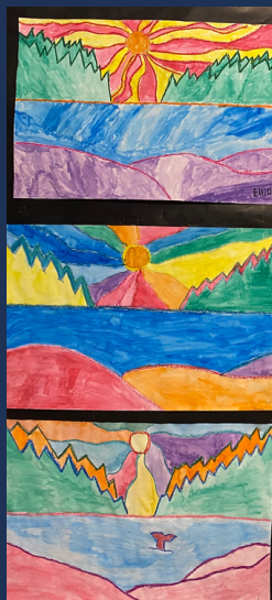
Paintings Inspired by Ted Harrison- By Division 5