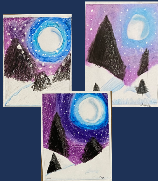
Winter Snowfall Drawings by Division 8