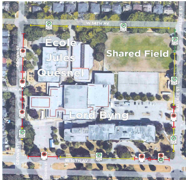
1 - JQ Traffic flow