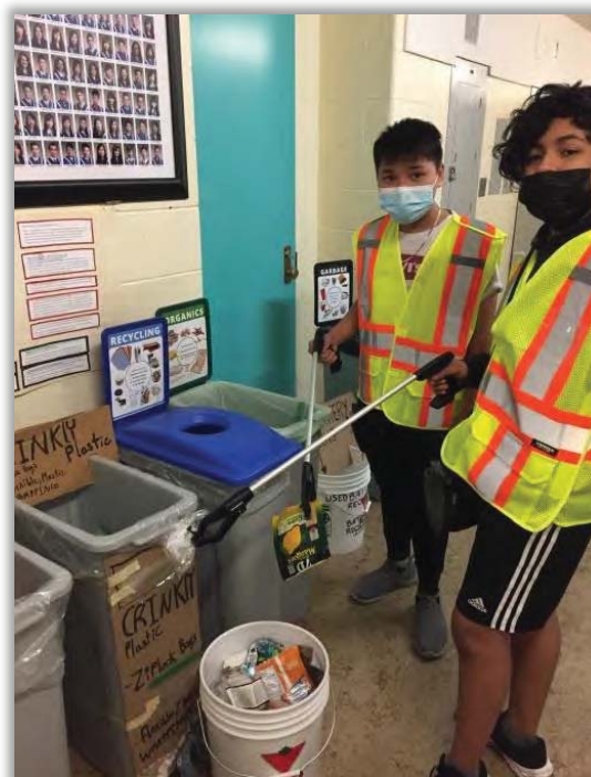
Rescuing items from a "trashy fate"

One teacher, along with several students at David Thompson Secondary recognized that their peers were failing to follow the basic recycling guidelines for the bins at school. Furthermore, they realized that many items going to landfill could actually be diverted with a little bit of extra effort and commitment. The Recycling Club was formed and set three goals: enhance the recycling system beyond the regular blue bins; increase the use of the organics bins; and spread awareness and knowledge so the student body can make the best choices about waste. Grant funds were used to purchase litter picker tools, buckets, high-visibility vests, and a storage rack. Recycling club volunteers use the tools to save recyclables from "a trashy fate" by removing them from landfill bins and placing them in the correct spot. Their teacher sponsor volunteers his own time to take the "specialty" items to the Zero Waste Centre. Meanwhile, they created a "mobile teaching station" to deliver training to other classrooms. The Recycling Club is now up to 25 members, as other students have joined the cause.