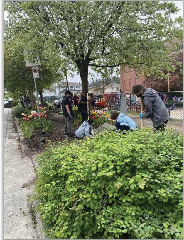
Boulevard garden at Wolfe Elementary

Their teacher says: “Not only did they create an amazing garden for their community, but they also learned valuable skills about design, plants, ecosystems, and budgeting. I think the most important lesson, and for me as their teacher, the most noteworthy growth has simply been in the students’ connection to the earth, and to their community. Litter is no longer tolerated. They have a keen eye for weeds, and a gentle step in the garden. We are so looking forward to maintaining the garden and this legacy in the future. “