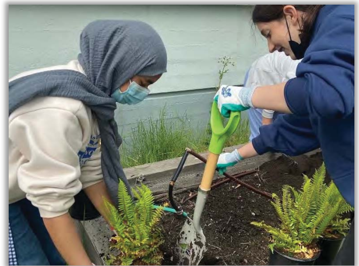
Planting Native Species at John Oliver Secondary