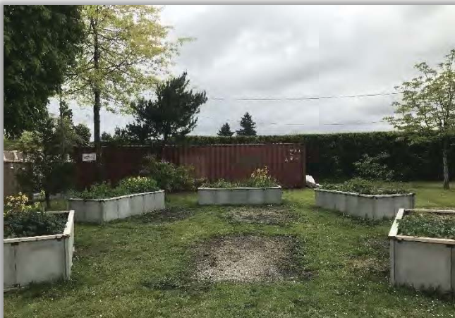
Rejuvenated Garden at Spectrum, West, and Foundation