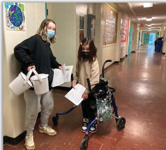
Classroom composting at Southlands Elementary