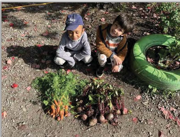
Harvest at Nightingale Elementary