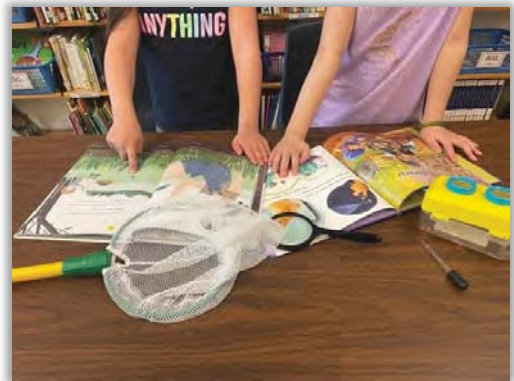
Students enjoying new nature books

Please see Appendix A for the Tecumseh Annex Booklist.