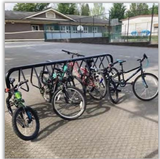
New bike rack installed at Fraser Elementary

Encouraging active travel, either all year round or for a special event like bike to school week or a walk, bike, and roll event, provides students and their families the opportunity to safely try out a different way of getting to and from school, with the added incentive of prizes, stickers, and celebrations. Improved infrastructure at school ensures that there are secure places to lock up bikes and scooters which helps make the choice to bike or roll to school easier.