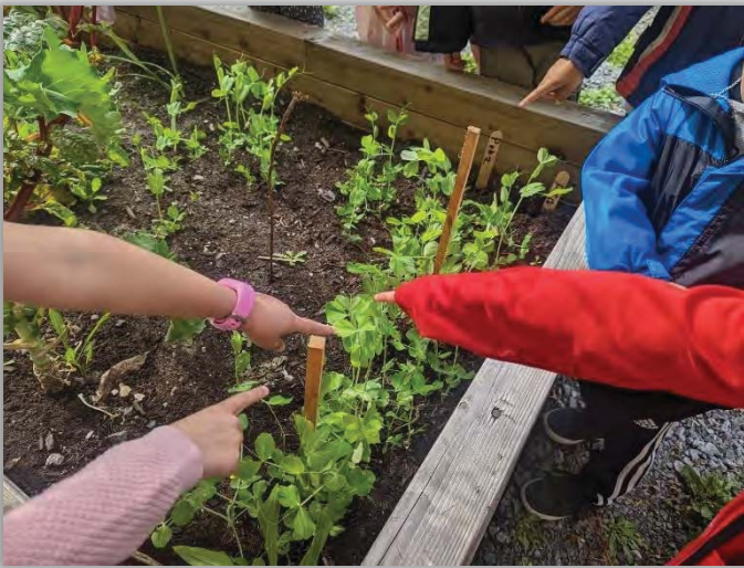
Growing peas at Selkirk Elementary