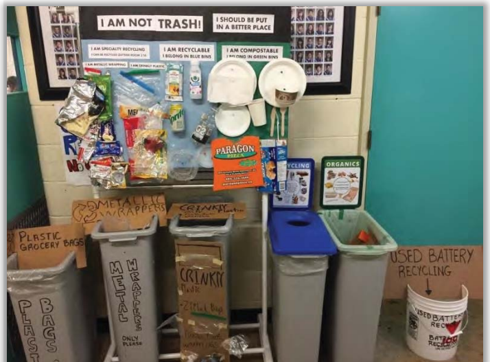
Enhanced recycling at Thompson Secondary