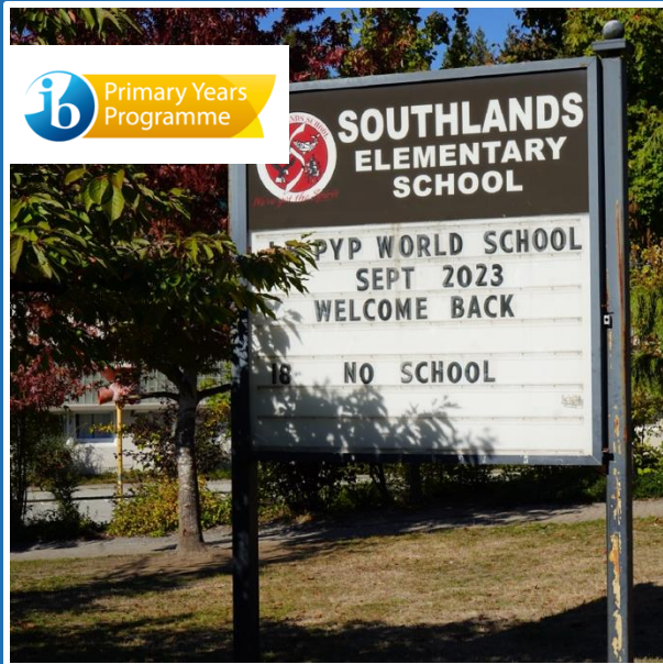
Southlands Elementary (K-7 School Program)