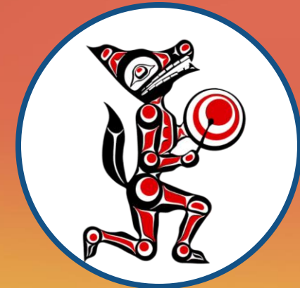
səlilwətaʔ (Tsleil-Waututh Nation)