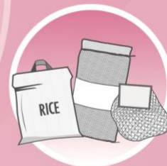
Woven Plastic Bags