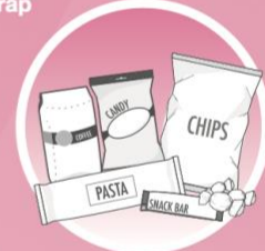
Crinkly Wrappers and Bags