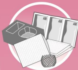
Protective and Squishy Cushion Packaging