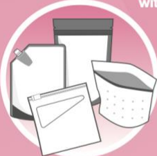
Zipper-lock and Stand-up Pouches