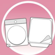
Flexible Packaging with Plastic Seal

During the collection event, bring your flexible plastics from home to school for recycling.