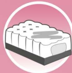
Outer Bags and Overwrap