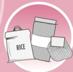
Woven Plastic Bags