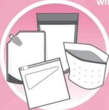
Zipper-lock and Stand-up Pouches