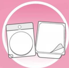
Flexible Packaging with Plastic Seal

During the collection event, bring your flexible plastics from home to school for recycling.