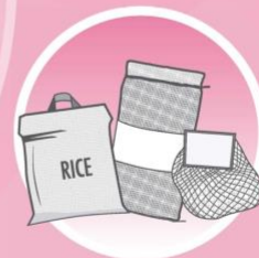
Woven Plastic Bags