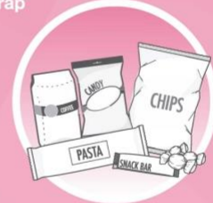
Crinkly Wrappers and Bags