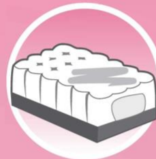
Outer Bags and Overwrap