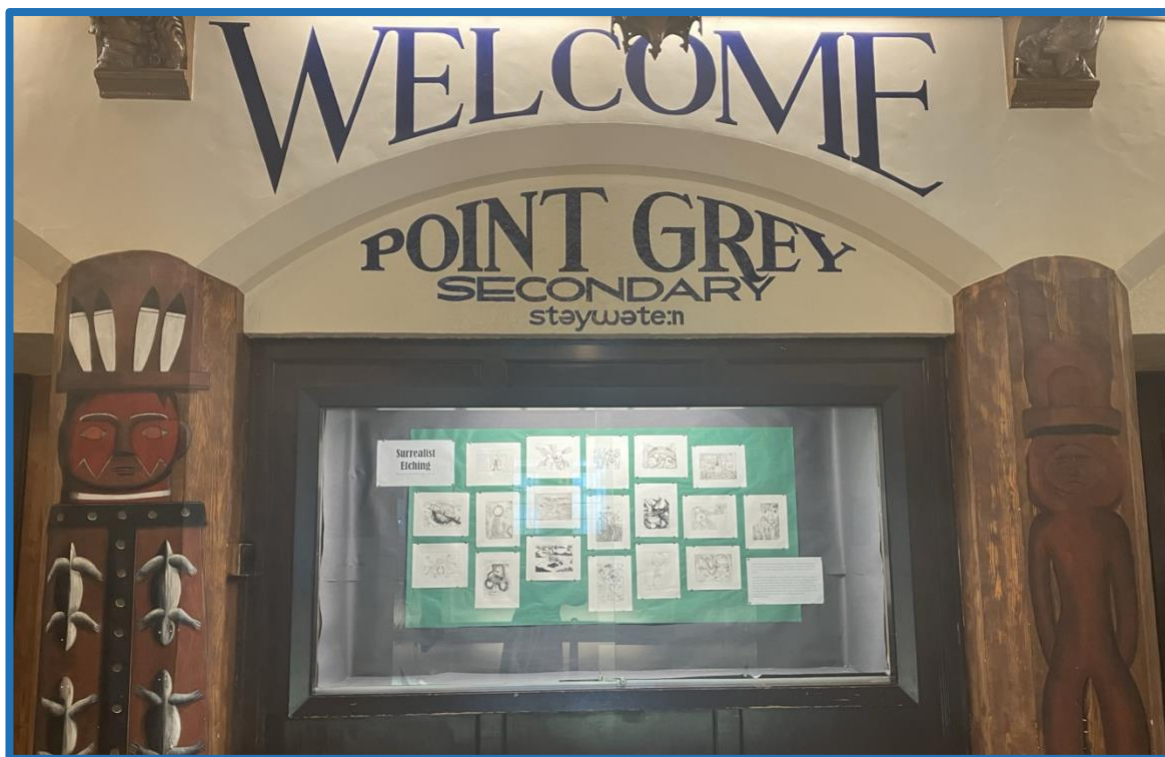
Surrealist Etching Display by Painting & Drawing 11/12