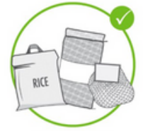
Woven Plastic Bags