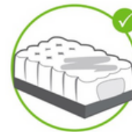
Outer Bags and Overwrap