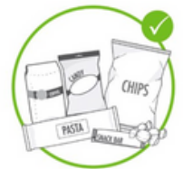
Crinkly Wrappers and Bags