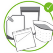
Zipper-lock and Stand-up Pouches