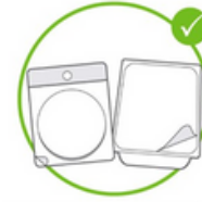
Flexible Packaging with Plastic Seal