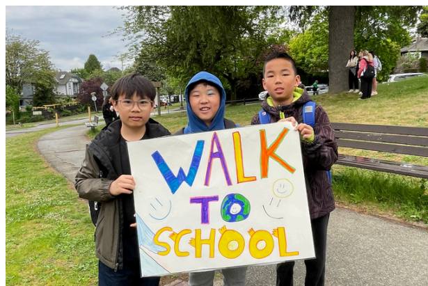
Hello Quilchena Families,

If your child is absent, please call the Quilchena Safe Arrival Line at 604-713-5159 EXT 68# or email quiattendance@vsb.bc.ca . This way the office can input your child's attendance accurately in our student system first thing in the morning.