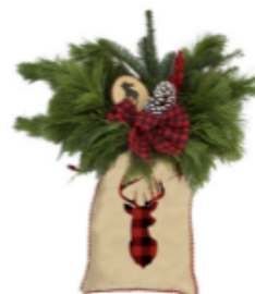
Hanging Greenery Bough - $35