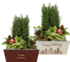
Tropical Indoor Planters - $35