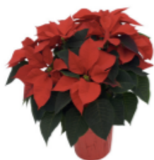
6.5" Poinsettia - Red and White - $15

Orders can be submitted online via the School Cash Online account .