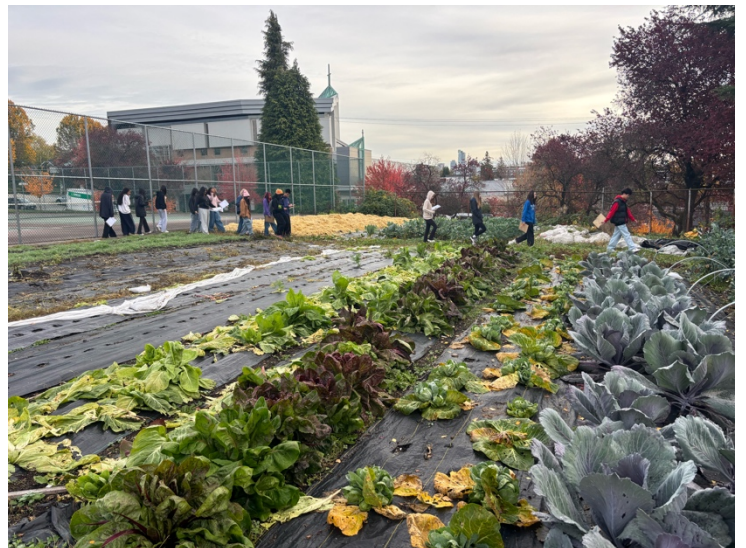
CLE10 at the Fresh Roots garden