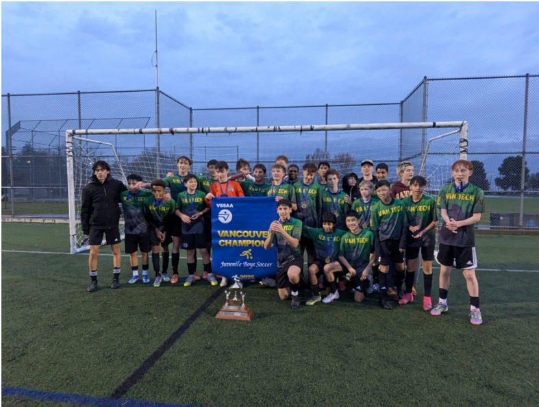
Juvenile Boys Soccer: City Champions