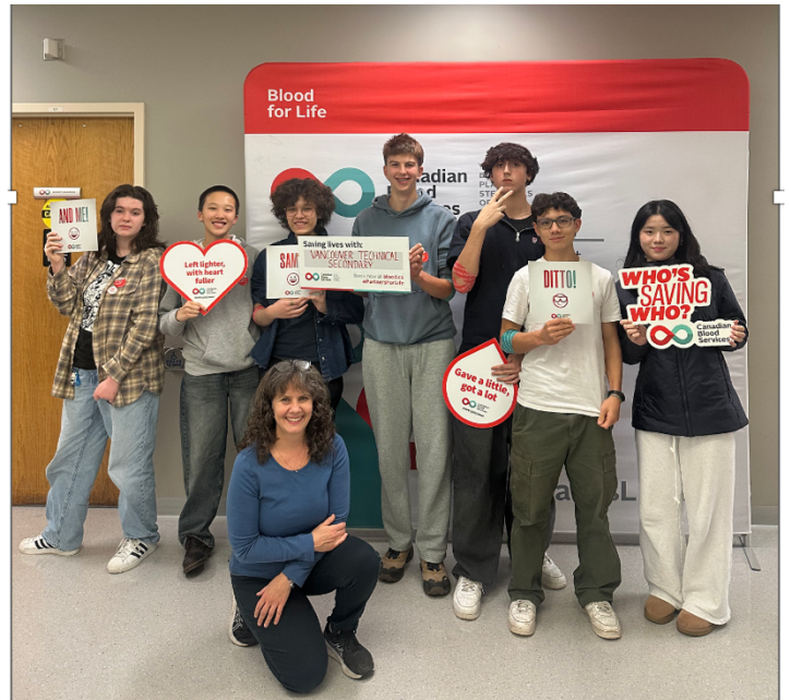
Van Tech Blood Club