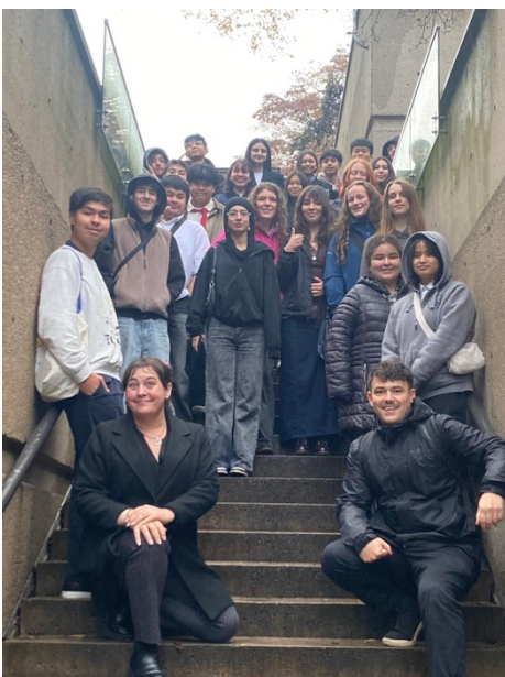
Law Studies 12 at the Vancouver Law Courts