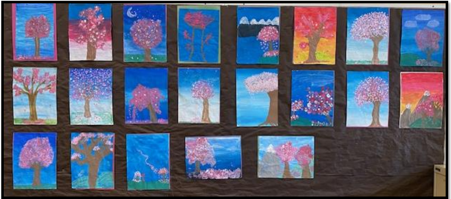
Div.12 (Above and Below)