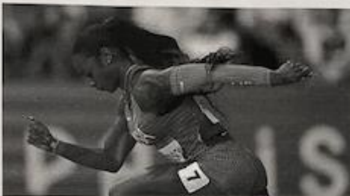
Photo-caption: Sha'Carri Richardson was shown in women's 100m