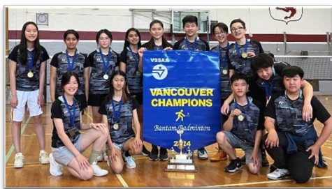
Batam Badminton Team