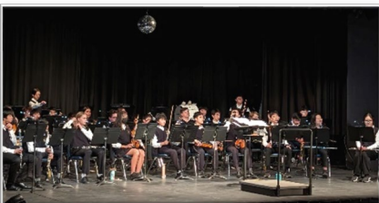
Beg. Band at the Spring Concert

Music students have been practicing diligently for the Spring Concert Extravaganza on June 6th. The concert, featuring both Beginner Bands, included six guest conductors, two pieces