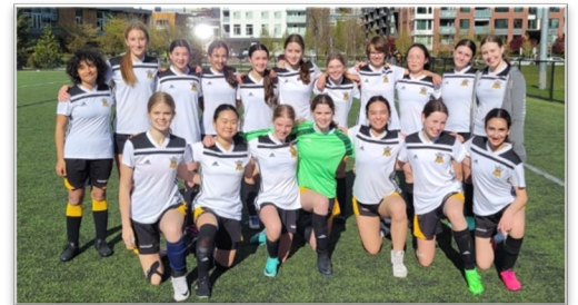
Sr. Girls Soccer Team