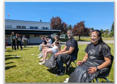
A beautiful day to... PIE a Senior!