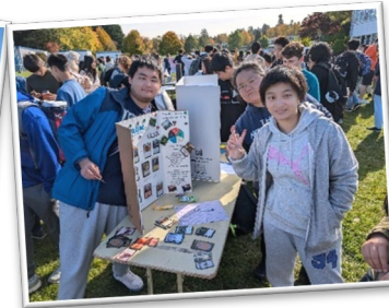
Back to School Blast, hosted by Student Council