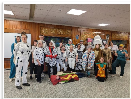
Halloween- Guess who these staff members are?