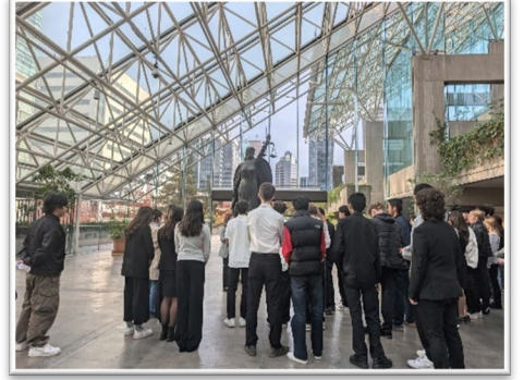
Field Trips, Field Trips, Field Trips! Highlighted experiences- MOA, UBC Botanical Gardens, Roger's Arena, Law Courts