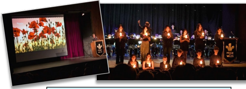
Thank you to Leadership, Stagecraft and Music classes for planning a very moving Remembrance Day Ceremony.