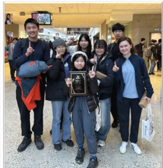
1 st Place- KPU Science Challenge (Jr Team)