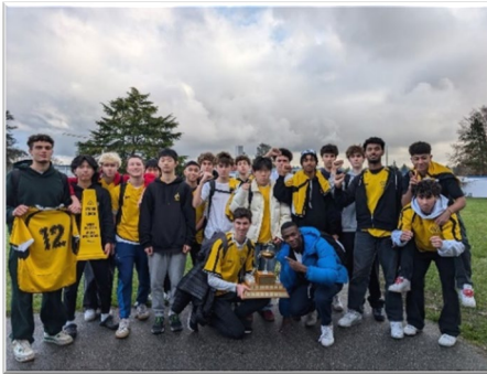
Sr. Boys Soccer Team-City Champs!