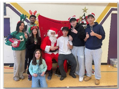
Thanks to Student Council for planning an amazing Winter Week!