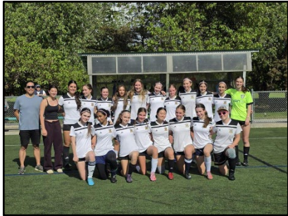
Sr. Girls Soccer Team-City Champs!