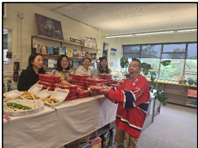
Thanks to PAC for the Teacher Appreciation Lunch!