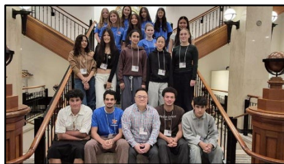
PW students at the VSB DEI Conference