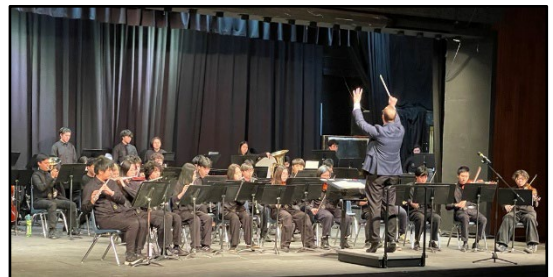
End of Year Concert