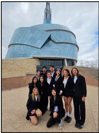
PW students at Ethics Bowl National Championship in Winnipeg

Over the last month, our students have thrived in clubs, fine arts, athletics, and hands-on learning, both in and out of the classroom, showing off their skills and hard work in all kinds of ways!