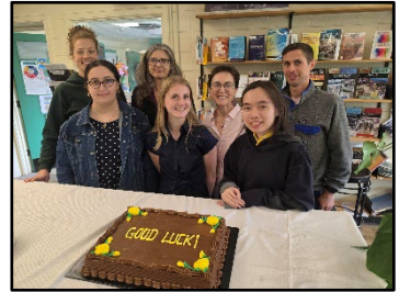
Best of Luck to our Teacher Candidates and thank to their PW School Advisors for the mentorship!