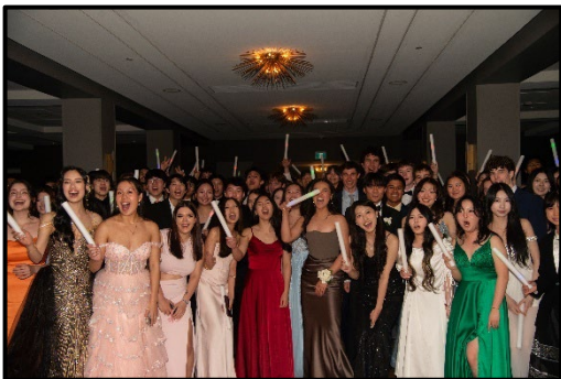
PW Prom 2026