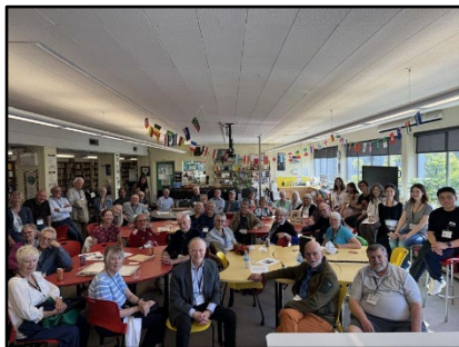
PW class of 1966 meeting with Grads of 2026 for a Q&A