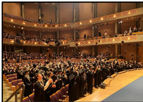
Celebrating the Grads of 2026 Graduation Ceremony @ Chan Centre

Check for the Family Bulletin that will be emailed to families and published on the school website in the last week of August. The newsletter will contain important information about the start of the new school year. We look forward to seeing you when school re-opens on Tuesday, September 8, 2026. Have a wonderful summer break!