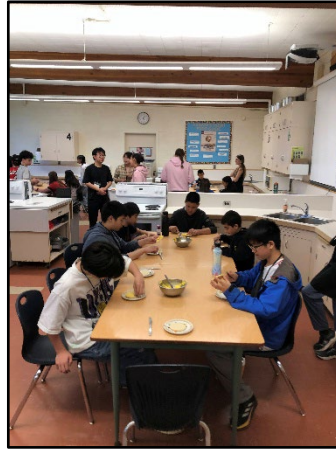
Grads of 2031 Mixer (Grade 7 Visit)