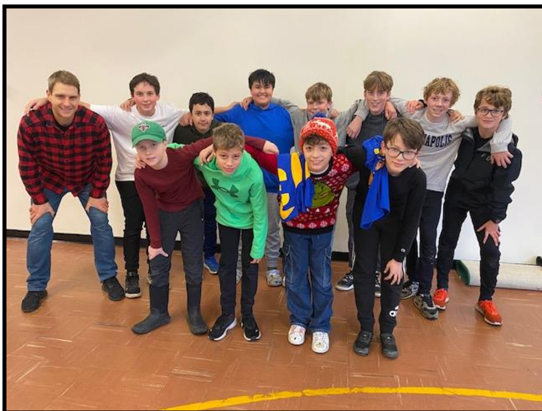
Congratulations to our Senior Boys Volleyball Team on a great season!