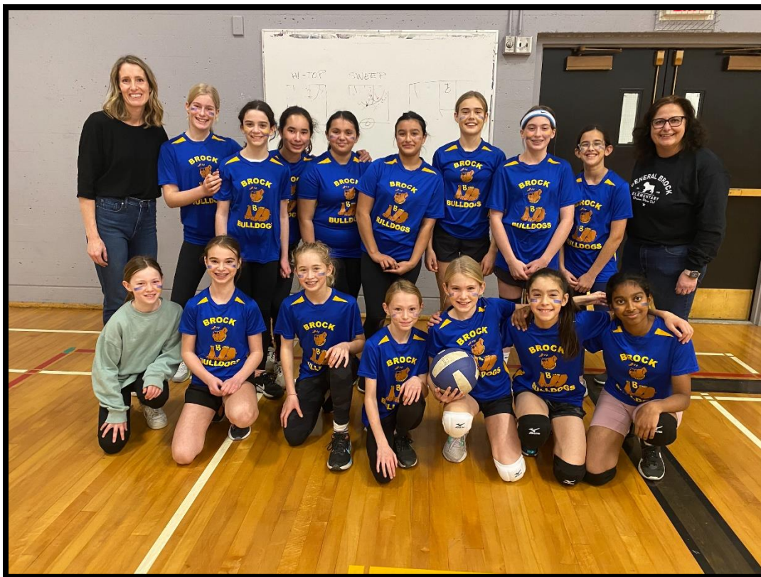
Congratulations to our Senior Girls Volleyball Team on a great season!