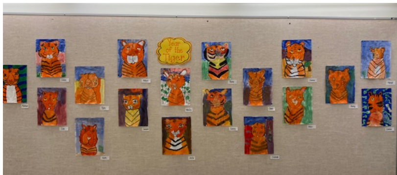
Tigers by Division 7

This year the first day of Lunar New Year was February 1 st . At Dickens, classes celebrated by doing a number of different activities ranging from art projects depicting tigers for the Year of the Tiger, paper lanterns and paintings of cherry blossoms; performing a ribbon dance; creating Power Points about Lunar New Year to teach their Kindergarten buddies; cooking chow mein; and making dragons and listening to and rewriting the story of Nian. We wish everyone good luck, good health, and happiness this year. How great to have so many new starts to the year. (New Year's Resolutions, take 2, anyone?)