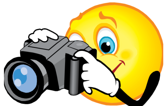
Photo Day is on Monday, April 19 th . Our photographer, Mountain West, has worked with us to ensure all safety protocols are followed. These protocols allow for individual photos only, and these photos need to be done outside. We will be using the second-floor outdoor deck so as not to interfere with our staggered recesses. We are not able to do full class photos, however we have asked our photographer to create a composite of individual photos for each class.