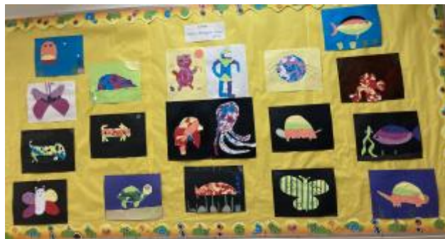
5 - Ms. Cheung's class - collage using analogous colours.