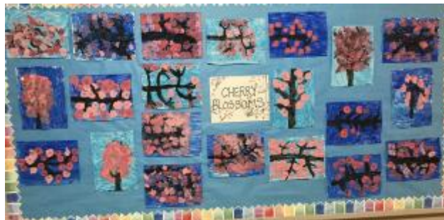
3 - Ms. King's class - cherry blossom art