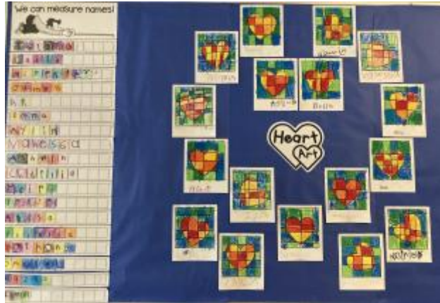
7 - Ms. Kwong's class - heart art