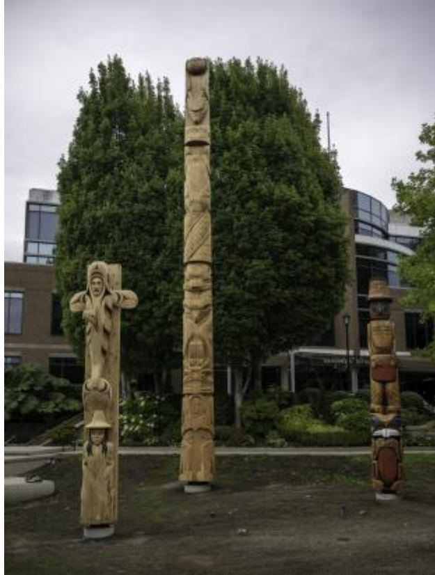
1 - Vancouver School Board

We acknowledge that we live, learn, and play on the unceded and traditional lands of the x w məθk w əyəm | Musqueam, Sḵwxwú7mesh | Squamish & səlilwətał | Tsleil-Waututh Nations.