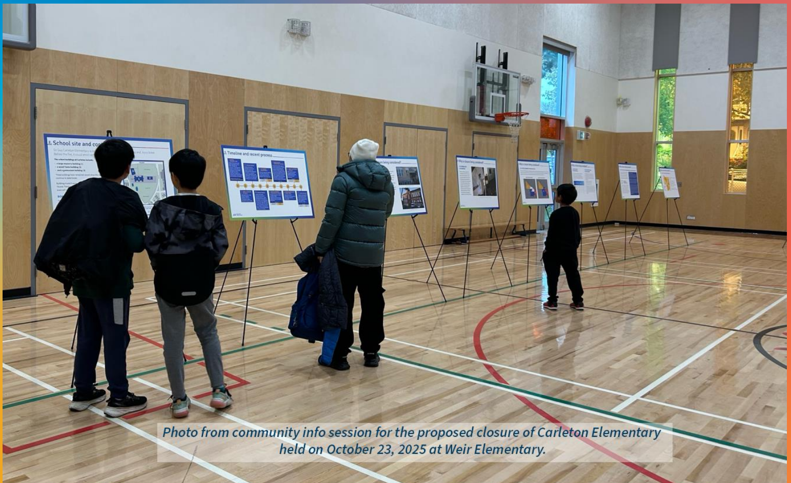
Photo from community info session for the proposed closure of Carleton Elementary held on October 23, 2025 at Weir Elementary.