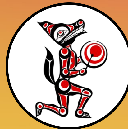
səlilwətaʔ (Tsleil-Waututh Nation)