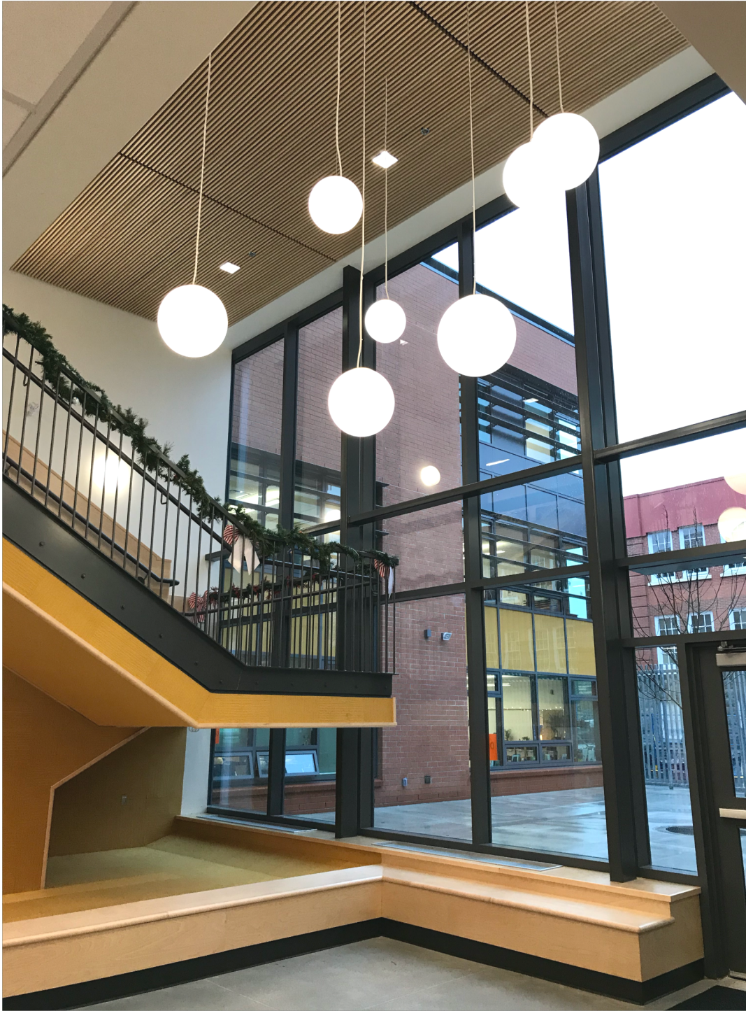
Foyer Fun Lighting and Carpeted Reading Area