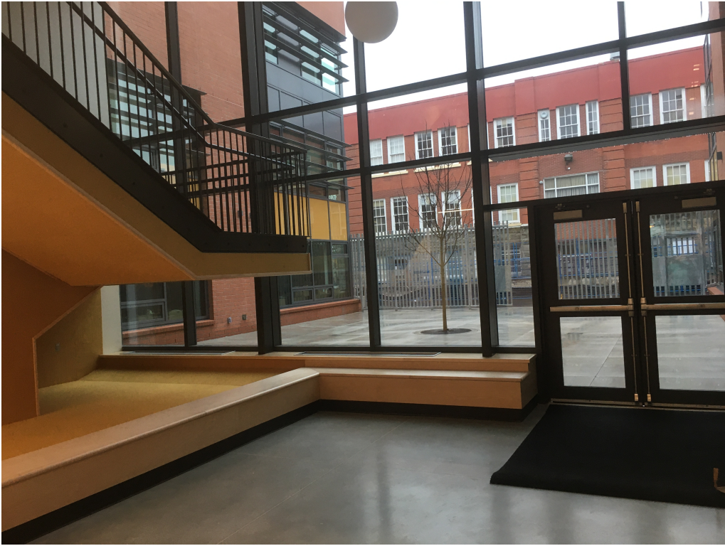
Foyer/Sitting Area to Outdoor Courtyard