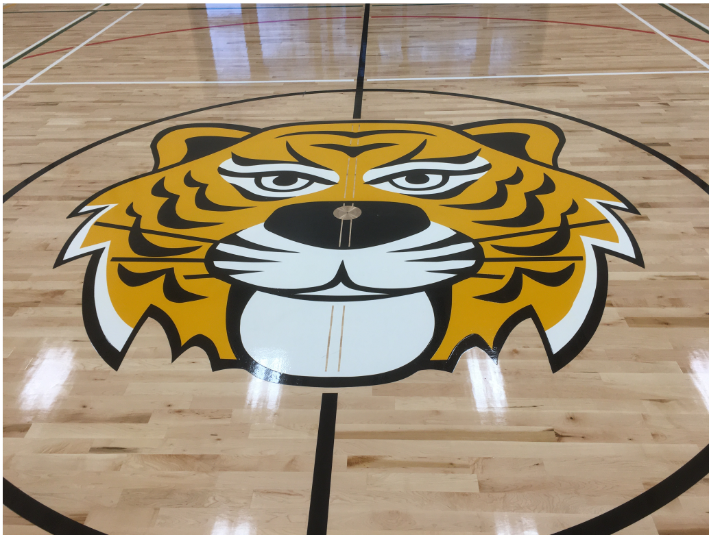
Our Tenny the Tiger Mascot!