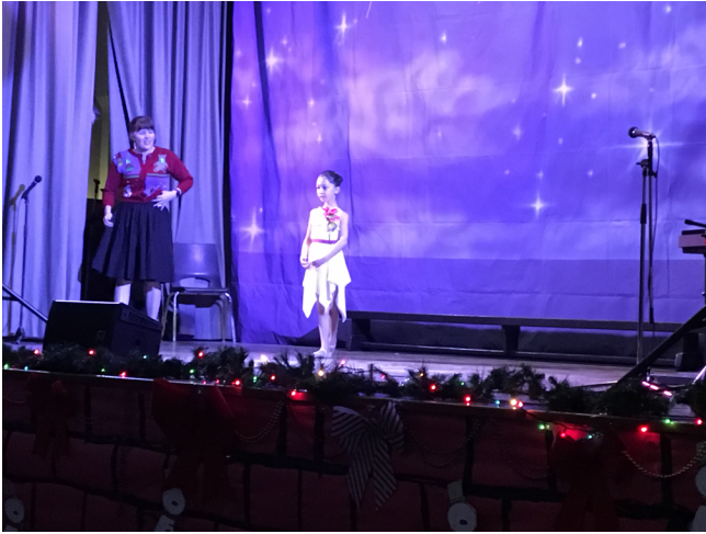
Arita (Gr 3) dancing