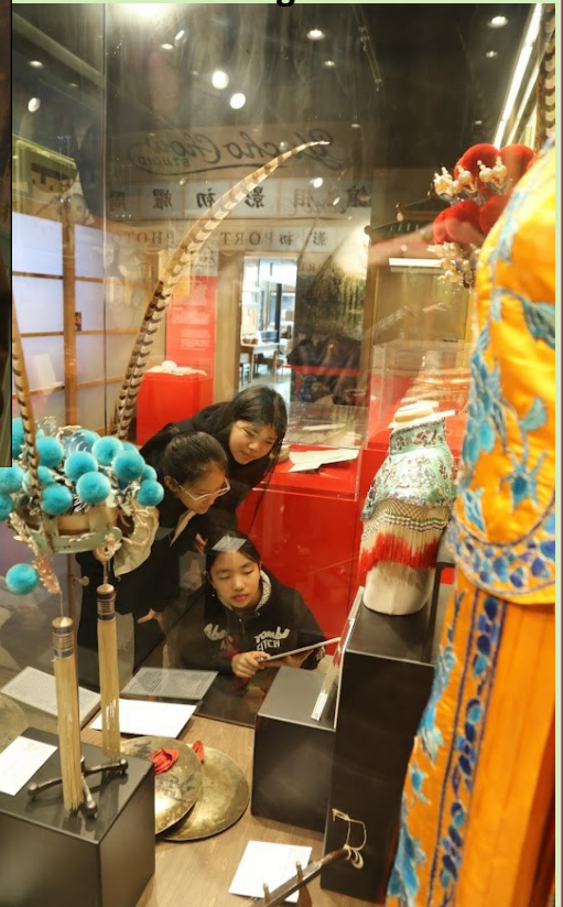
Postcards with doves for world peace done by the Humanitarian Club members