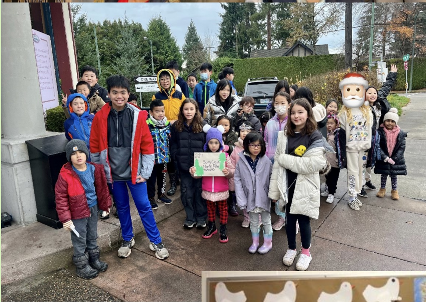
Big Buddy class (Div 3) accompanied their little buddy class (Div 12) to the mailbox to deliver their Santa letters