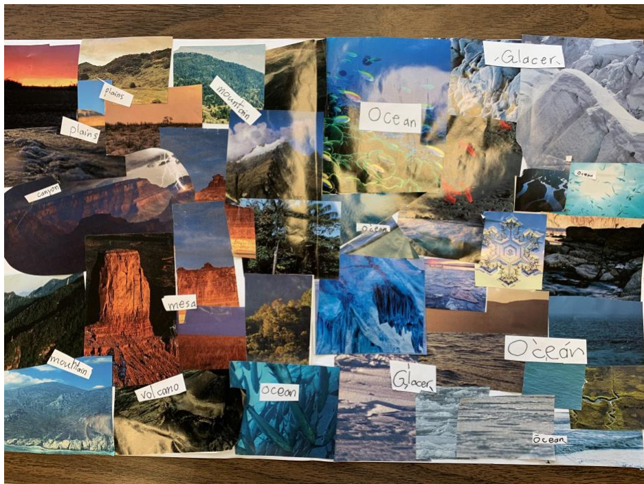
Landform Collages by Division 10