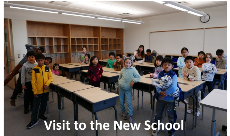
Visit to the New School

Purdys Chocolate and Gift Cards Holiday Fundraisers— Deadline is this Friday, November 24